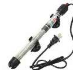
Aquarium heaters -K348